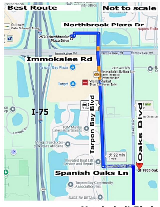
Vanderbelt Blvd Map to BOB EVENS